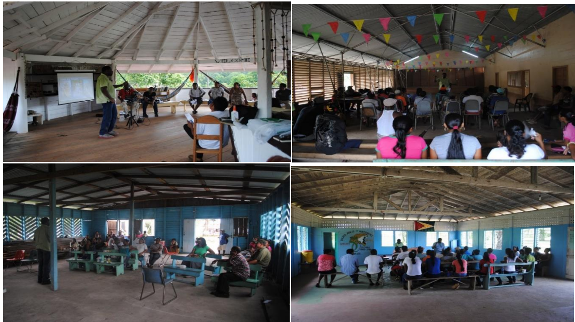
Figure 2: Scenes from four workshops.